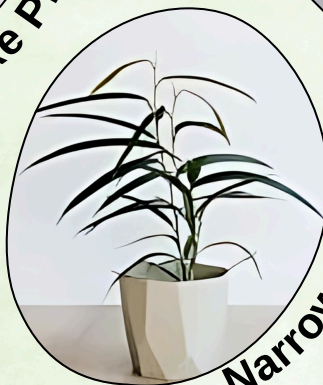
Narrow Leaf Fig